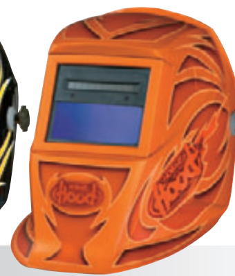
#770445 Blaze Orange