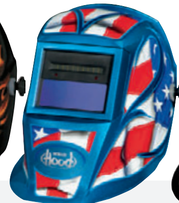
#770663 Patriot II