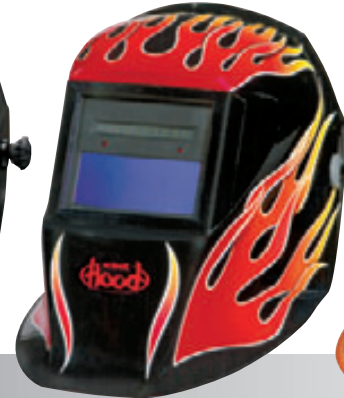
#770450 Black 3D Flame