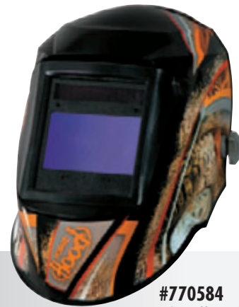
#770584 Prowler Off-Road